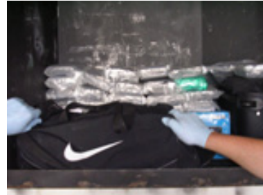
Bricks of cocaine inside the refrigeration unit

CBSA officers work to keep illegal drugs and other contraband from entering Canada. Since 2007, officers in the Pacific Region have seized 1.35 tonnes of cocaine. These seizures are an important contribution toward keeping Canadian communities safe.